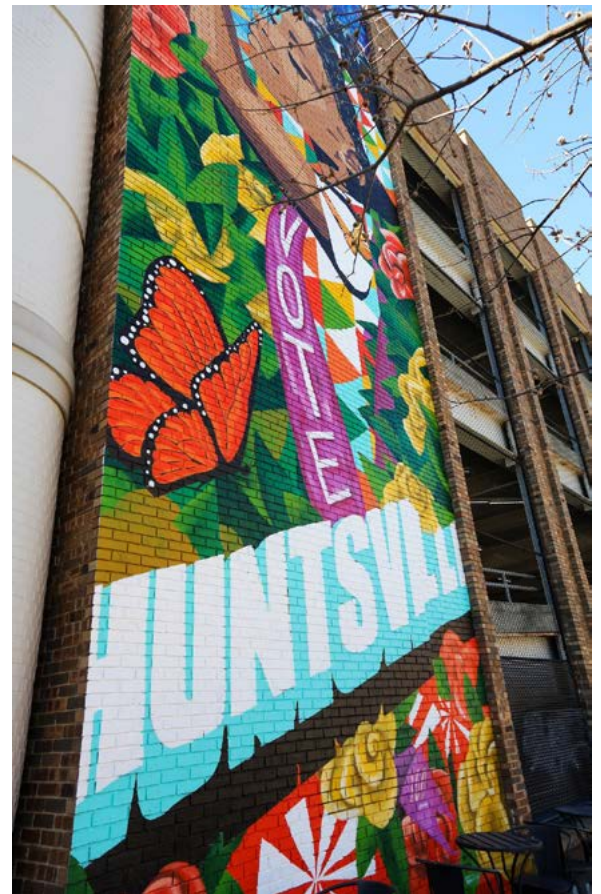
Artwork site: above left on Jefferson street. 'This Girl Can': above right, opposite side of garage Washington street.